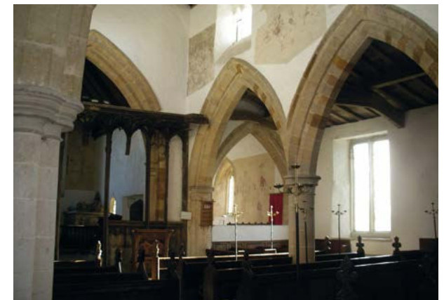
Photo: Medieval interior, Stoke Dry

Medieval churches must often have been spectacular to enter: a compartmentalized interior, a glorious chancel for the liturgy of the mass, images of saints, an elaborate reredos to a high altar, a rood screen