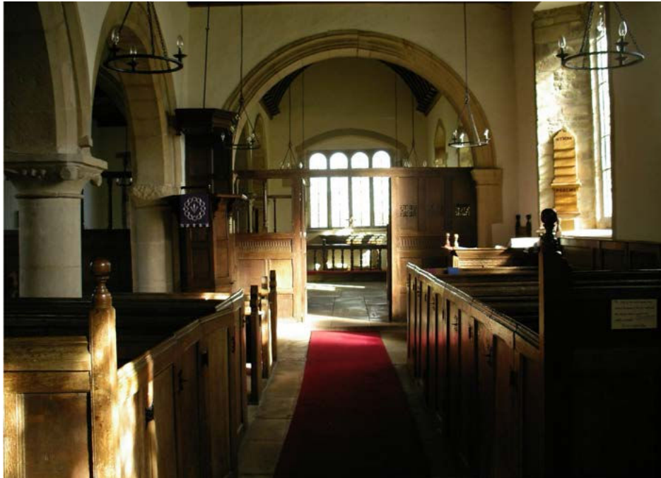
Above: Elizabethan interior, Brooke

By Elizabeth I's reign, the Protestant Reformation had brought a complete liturgical change: a communion table in the centre of the 'chancel' or even in the nave, whitewashed walls. Morning and Evening Prayer, now in English, were read in the nave among the people, who sat in pews. The government insisted that each parish should provide a 'comely and honest pulpit'!