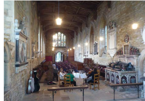
The quartet in rehearsal in Noseley Chapel