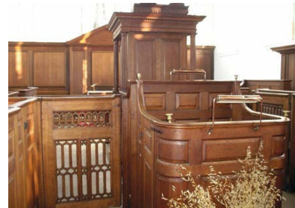
18th century interior, Kings Norton

Then came the Georgian Church: Holy Communion usually only three times a year; box pews with doors for those who could afford the rent; the squire's pew in a prominent position; galleries added to provide extra accommodation, especially in town churches; a plain table at the east end with the Tablets of the Law, Lord's Prayer and Creed above it, but the pulpit, often a 'three-decker', being by far the most imposing feature, long sermons requiring hour glasses. Organs were now rare, the singing of metrical psalms and anthems being led by an enthusiastic choir accompanied by a small band who were often accommodated in a gallery at the west end of the church. As Christopher Wren had written: 'It is enough for the Romanists if they hear the murmur of the mass and see the elevation of the Host, but our churches are to be fitted as auditories.'